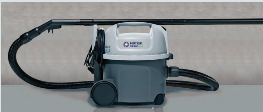
VP300 can be carried safely and comfortably in one hand