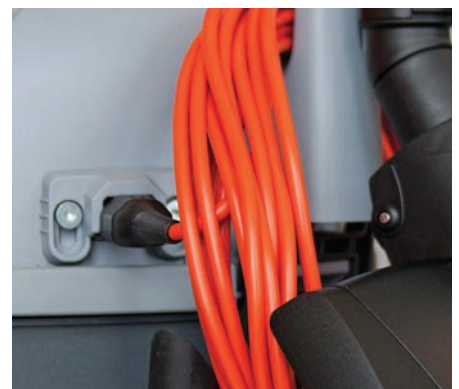
Detachable orange cord (VP300 HEPA)