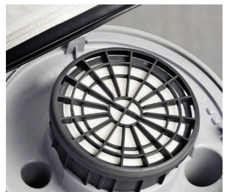
Higher filtration level with HEPA filter (VP300 HEPA)