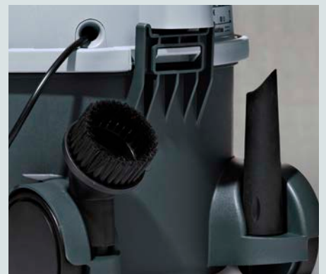
Discreet storage for nozzles allow all the tools you need to be within easy reach at all times